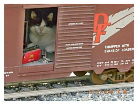
From the Office of The Littlest Hobo

Remember: Dues are due at the time of the meeting. Anything passed the meeting date by 30 days will be considered null and void. Dues are only $25.00 per year. Cheap compared to other groups. New membership cards will be issued 30 days after the membership meeting. After March 7 2016 anyone not having a new membership card will not be allowed to participate in any membership functions.