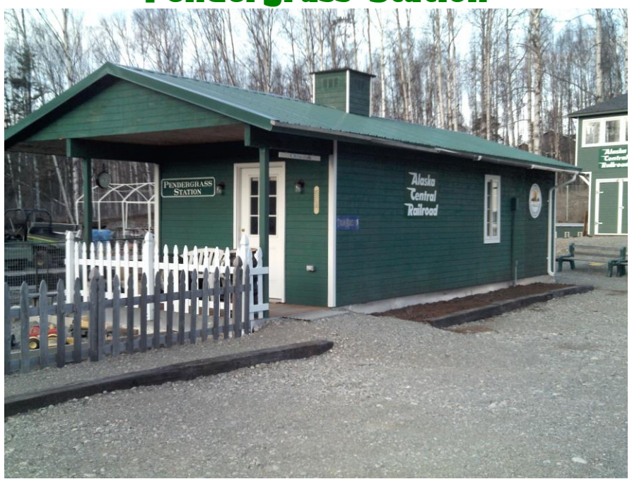
Page 4 Pendergrass Station

This Station was built at the old site several years ago. How to move it was the problem. There was years of debate on how we were going to move it. Among many ideas were to sell it and build a new structure at the new site. Moving it was an almost impossible situation due to the high cost of the move. $7000.00 was the lowest bid we had. That did not include the cost of any low hanging lines that had to be moved, permits or pilot cars. Jerry Pendergrass took on the project. He tore down the building board by himself and rebuilt it at the new track site. Insulation was added with an extra room on one end for storage and an office space. Many, many, thanks to Jerry from all the members.