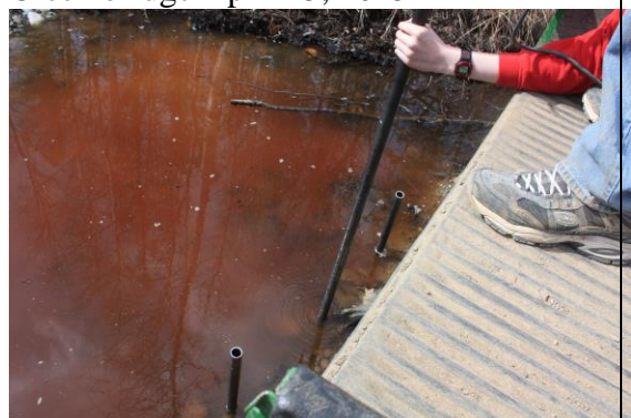
Zach holding a piling while Mark tries to drive it into the ground. The bridge was finally installed in July of 2015.