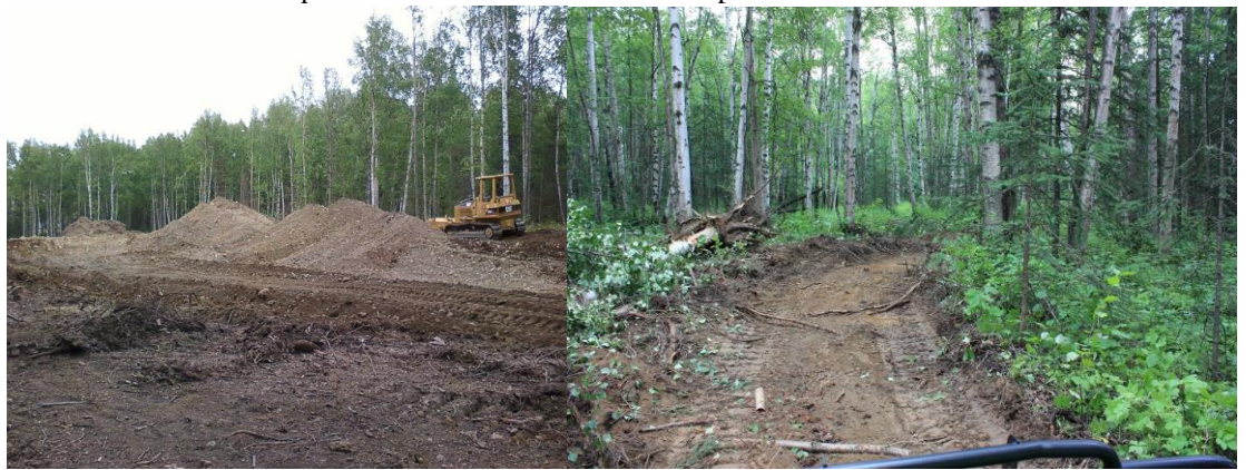
Looking at where parking is today

Looking towards the entrance of the property with the access trail we had to build. The Illustration of the required roadbed over the swamps.