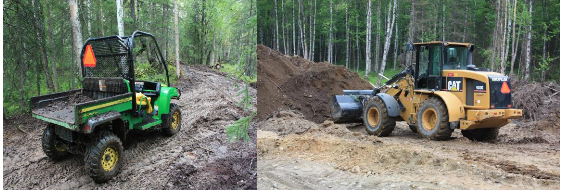
Working in the mud fall 2010