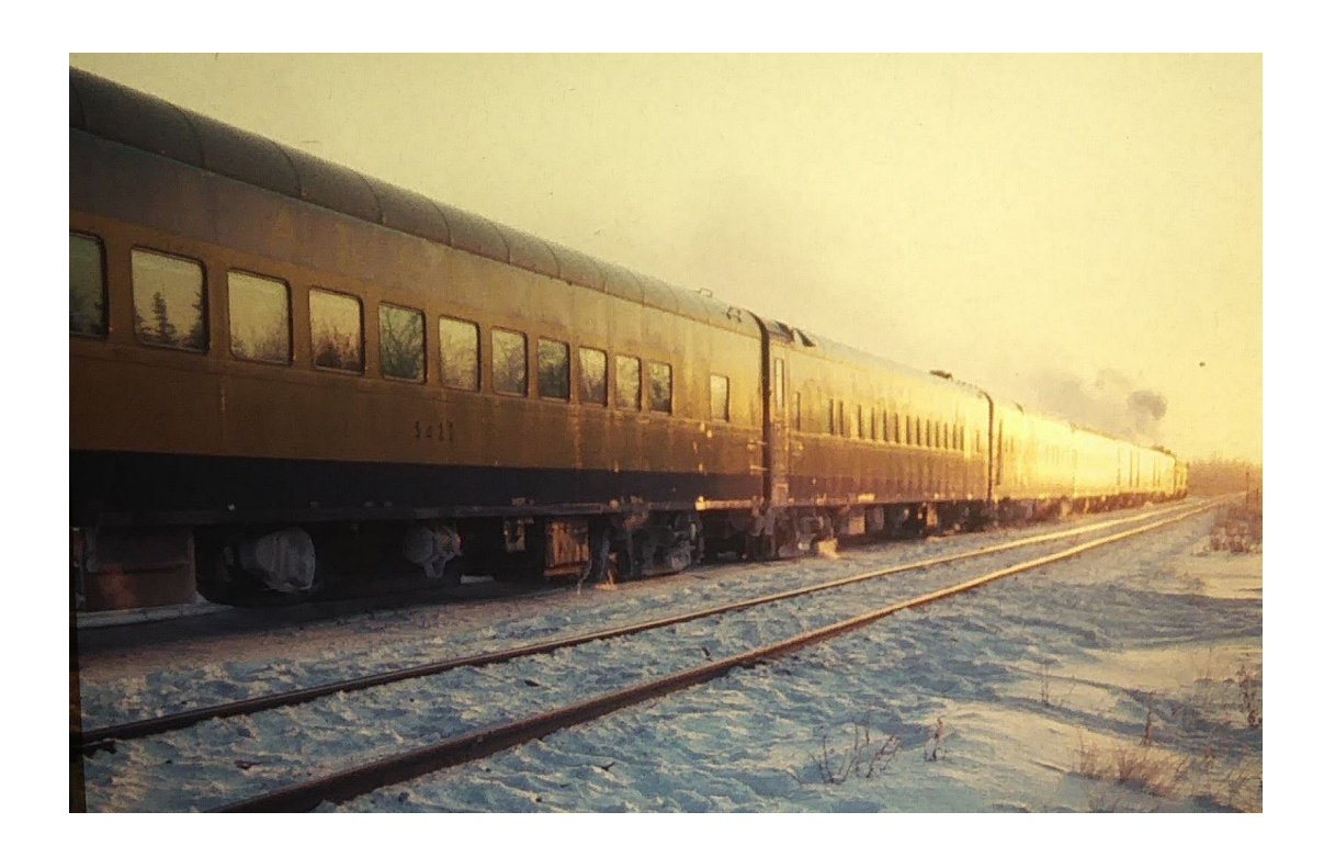
Steve on Number 5 at Nenana during the cold spell of December 1975